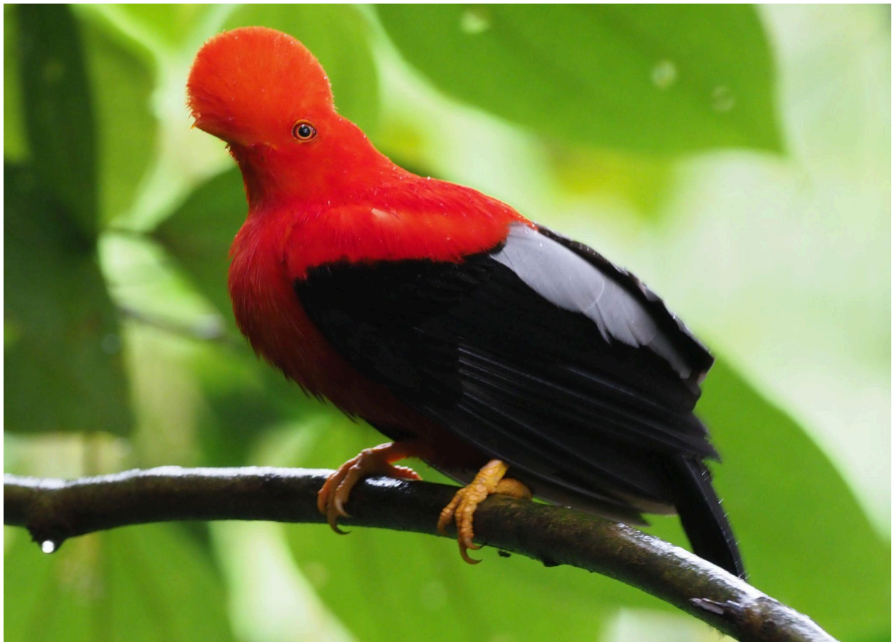
Andean Cock-of-the-rock

This tour celebrates the opening of Colombia's newest birding lodge, allowing one to bird in very comfortable accommodations in some of the best birding sites in Colombia, without having to spend much time in a vehicle. The Araucana Lodge is a brand new lodge (opening date is January 2019) designed specifically for birders and nature lovers, with spacious rooms and all the comforts that ensure a good night's rest. For those who enjoy bird photography, Araucana Lodge and many of the reserves along the route have excellent feeder set ups that provide some of the best photographic opportunities in Colombia.