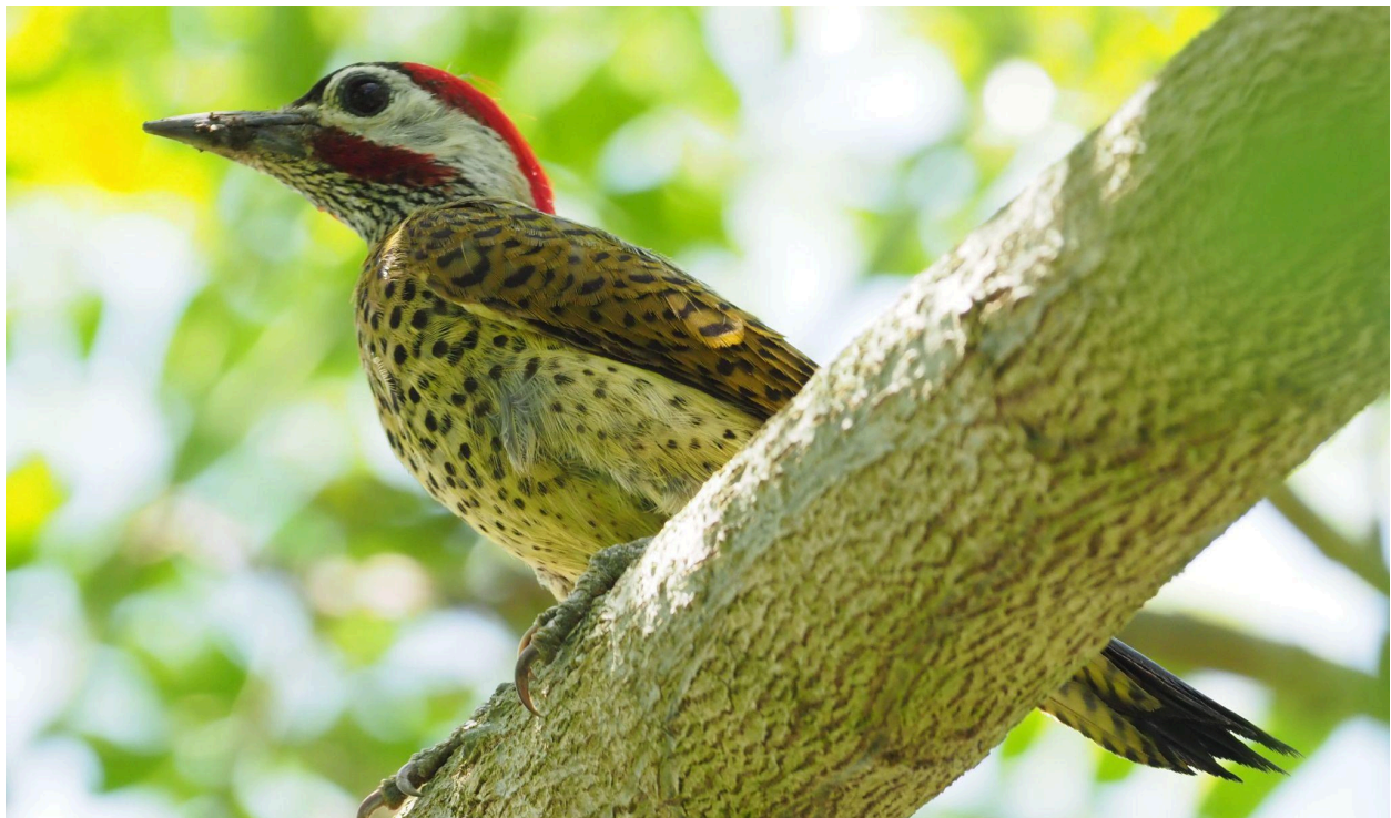
Spot-breasted Woodpecker

This morning we'll visit the village of Atuncela, about 40 minutes from the lodge, where a fascinating habitat exists due to a very localized rain shadow. A dry forest with several endemic species of cactus harbors entertaining species such as Bar-crested Antshrike and Striped Cuckoo. Other targets of this area include Pale-breasted Spinetail, Golden-rumped Euphonia, the endemic Apical Flycatcher, and Cocoa Woodcreeper. Lodging: Araucana Lodge