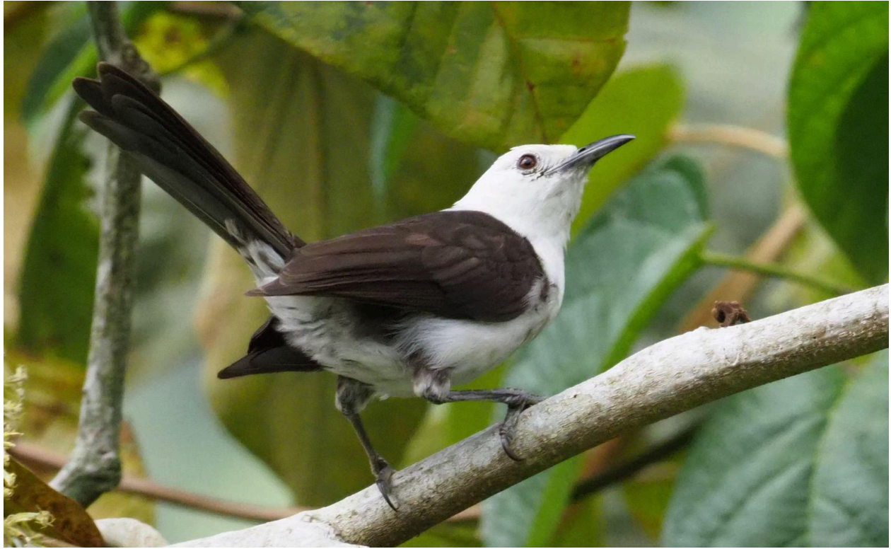
White-headed Wren

Toucan, Stripe-billed Aracari, Black-tipped Cotinga (NE), Rose-faced (NE) and Blue-headed Parrots, Spot-crowned and Five-colored Barbet (NE), Broad-billed Motmot and Purple-throated Fruitcrow and Tawny-crested Tanager. The area is teeming with Antbirds, with chances to see Ocellated, Jet, Stub-tailed and Bicolored Antbirds. With the high humidity and heat, it is best to have bagged species such as Pacific and Checker-throated Antwrens, Pacific Flatbill, Cinnamon Becard, Thicket Antpitta, Black-chested Puffbird, White-ringed Flycatcher, Blue-black Grosbeak, and Blue-crowned and Golden-collared Manakin before lunch. Lodging: Araucana Lodge