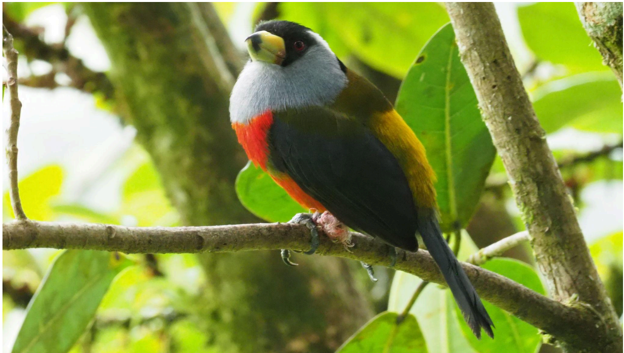
Toucan Barbets are one of the star attractions near Cali.

Lodging: We will stay at the wonderful ARAUCANA LODGE for the entire duration of the tour.