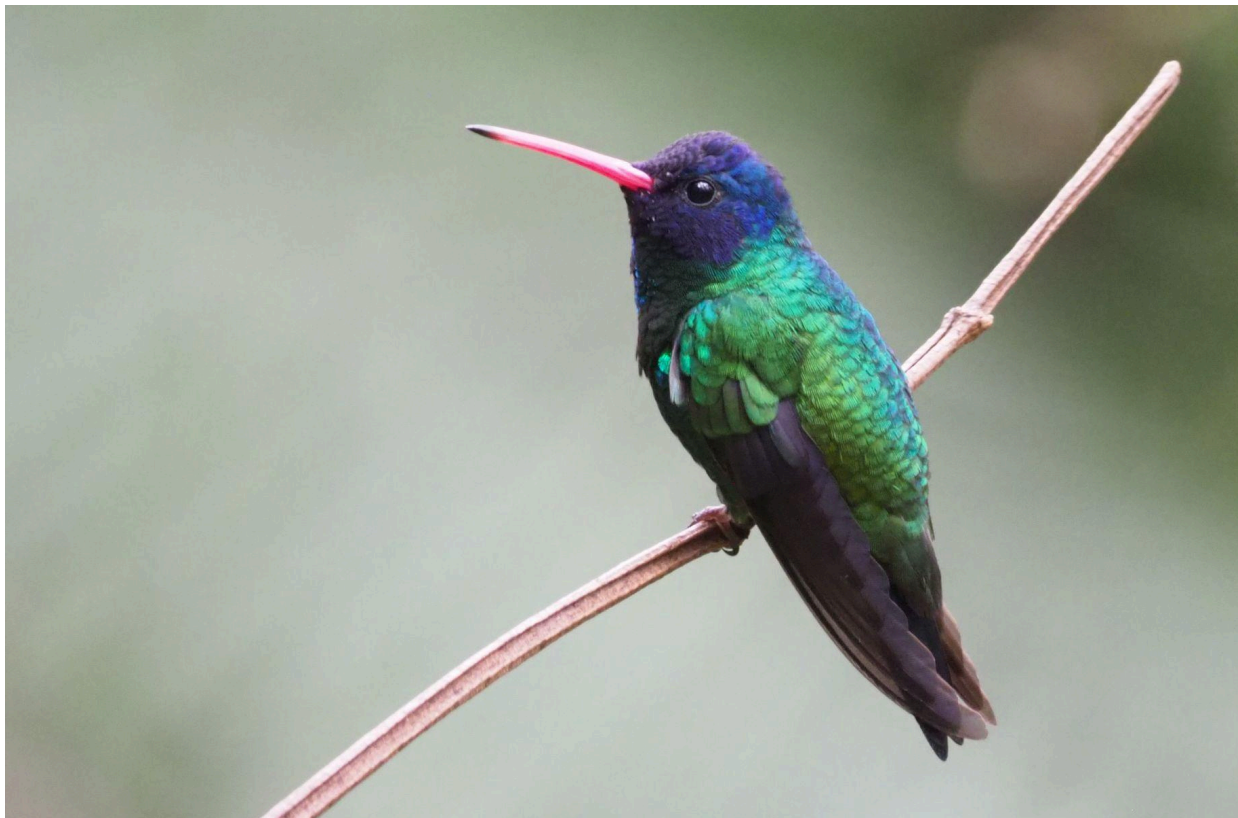
Blue-headed Sapphire

Tanagers foraging alongside Scaled Fruiteater, Chestnut-breasted Chlorophonias and Golden-headed and Crested Quetzal. Apart from a visit to an active Andean Cock-of-the-rock lek, this tour dips into the humid forests of the Pacific lowlands in the San Cipriano Reserve, where the habitat and the species differ dramatically from those in the Andean Cloud forests. Another destination is the Upper Anchicaya Valley, in one of the most biodiverse national parks on the planet: Farallones NP. Found along The Old Buenaventura Road, which descends from the western Andes to the Pacific Ocean, the area is one of Colombia's newest destinations to open up to birding and is AMAZING. The road provides a mind-boggling diversity of birds and is such that it inspired Steve Hilty to start work on his Field Guide to the Birds of Colombia. This was the first ornithological field guide for South America and inspired a myriad of ornithologists on the continent.