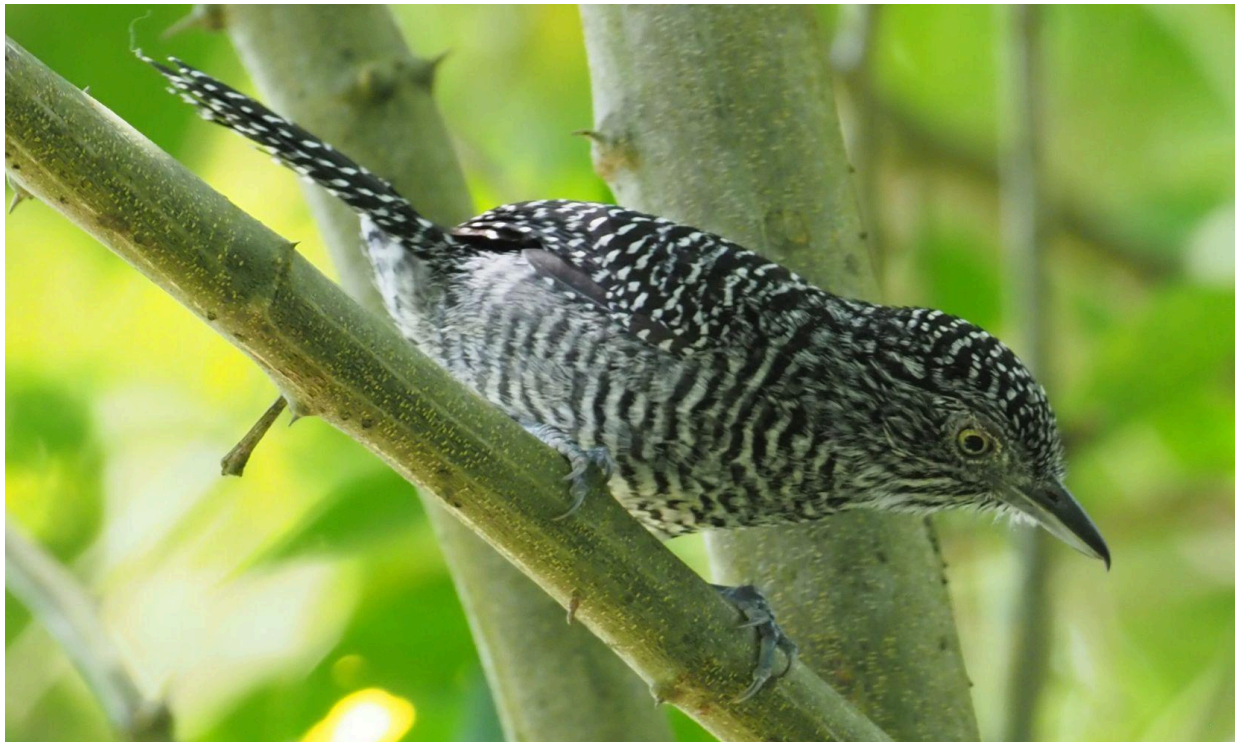
Bar-crested Antshrike

The day will be spent at the Araucana Lodge in search of some of the targets at the lodge that include species such as Parker's Antbird, Grayish Piculet, Apical Flycatcher, Smoky-brown Woodpecker, Bar-crested Antshrike, Spectacled Parrotlet, Scaled Antpitta, Crimson-rumped Toucanet, Colombian Chachalaca and Scale-crested Pygmy-tyrant. We will also have a chance to explore the trails that wind through the pre-montane forest that is protected by the owners of the lodge and a stroll around the organic vegetable gardens is also a treat! Lodging: Araucana Lodge