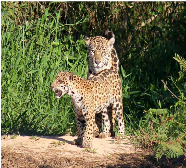
Jaguar female with offspring

Well a picture speaks a thousand words and I could not agree more, among the birdlife we added the range-restricted Fawn-breasted Wren, Pied Plover, Large-billed and Yellow-billed terns. Yet everything was overshadowed by an amazing jaguar sighting, what a day.