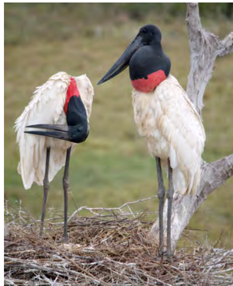
Jabirus on a nest

We made another trip to the forest islands in the morning and birded around the pousada, adding the amazing Great Rufous Woodcreeper among others. The trip down the Transpantaneira is a must for any birder, the sheer number of waterbirds is difficult to comprehend, one single field held 85 Limpkins. We made many stops en route enjoying close views of hordes of Snail Kites, at our lunch stop we enjoyed a Jabiru nest at eye level thanks to an ingenious towers, and in the Campos do Joffre area we caught up with the Scarlet-headed Blackbird.