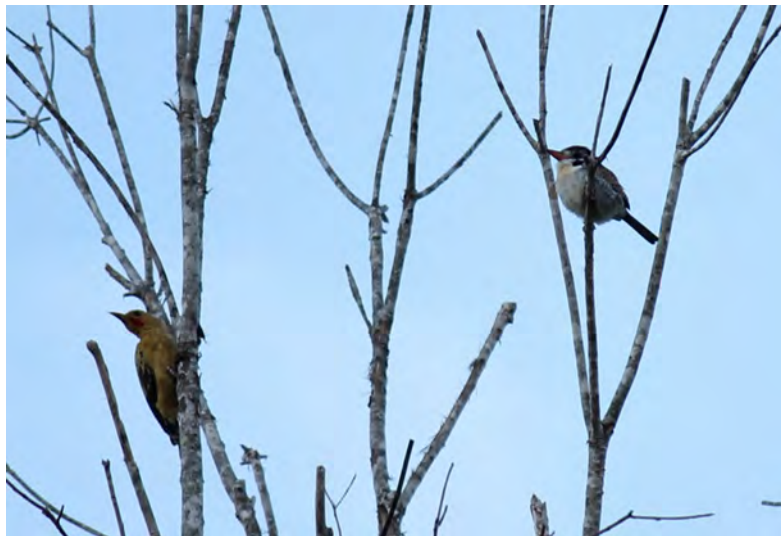
Cream-colored Woodpecker and White-eared Puffbird

Today we transferred to the Serra das Araras west of Cuiaba after a final morning of birding in the Pantanal, where we added good views of Hooded Tanagers. The Harpy Eagle nest at Currupira das Araras had unfortunately been abandoned three months prior to our visit, but we were still thrilled to check out this interesting area where the Cerrado meets the Amazon. During our first afternoon we were not disappointed and while visiting the old eagle nest obtained great views of Cream-colored Woodpeckers and White-eared Puffbirds in the same tree. We worked hard to get onto one of the calling Undulated Tinamous, but the bird outsmarted us by flying straight up in the air instead of walking into view. We also enjoyed our first views of Dusky-headed Parakeets, a species we do not see on any other section of the tour.