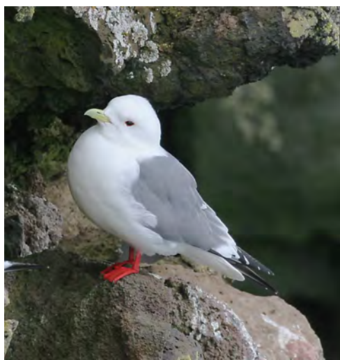
Red-legged Kittiwake