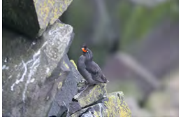
Crested Auklet