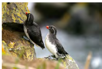
Parakeet Auklets

Breakfast at 7:00. Birding until lunch at 12:00. Birding from 1:30 until dinner at 5:30.