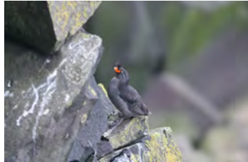
Crested Auklet